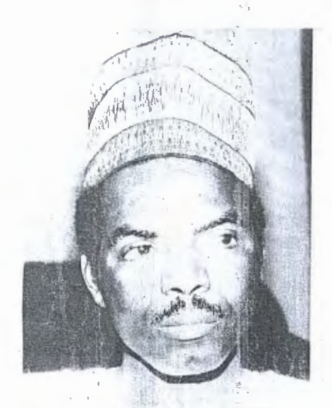
Alhaji Moh'd Arzika (OFR)

the infrastructural development projects in Sokoto State in order to accelerate its social and economic development.