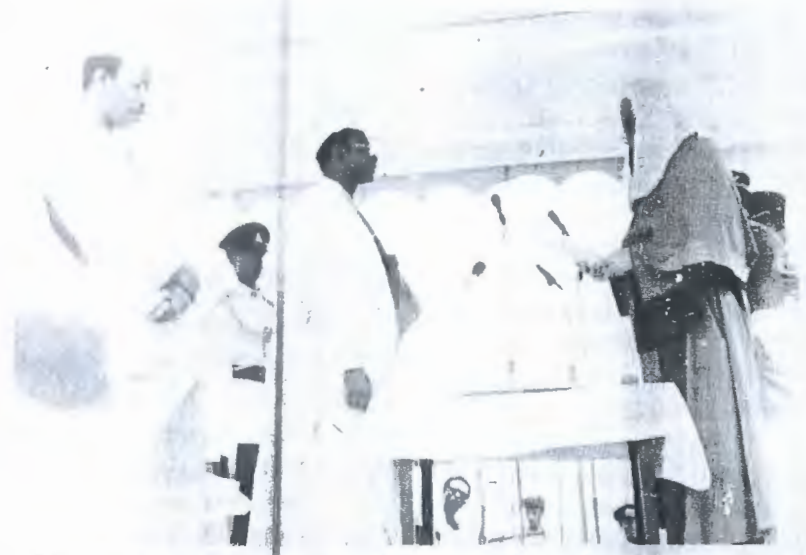
The beginning of a new era: Governor Shehu Mohammed Kangiwa being sworn-in as the first Executive Governor of Sokoto State.